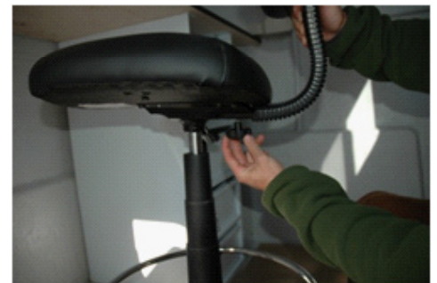
Figure 1b: Step 1

2. To install the securing strap: Choose a location for the task chair. Typically, within a splicing vehicle there exists a clearly defined work space at the countertop. This space may or may not have a drop tray within the countertop and typically has a drawer module cabinet located to one side and a single hinged door cabinet module located to the other side. When secured, the chair will be held against one of these cabinets and the forward edge of the countertop to restrain motion. The strap can be secured to either cabinet adjacent to the work space. NOTE: The strap will be much easier to install at the side of a hinged door cabinet as access to the back side of the fasteners is limited in the drawer module without removal of the drawers themselves.