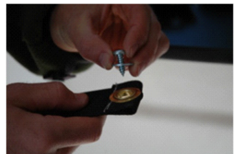
Figure 2: Step 4

4. Utilize one of the included truss head screws and a flat washer in each of the strap's end grommets to secure the strap to the cabinet at the two hole locations. Utilize an additional flat washer and a locking nut inside of the cabinet to fasten each of the screws and strap ends. Tighten each fastener with a screwdriver and 7/16" hex wrench.